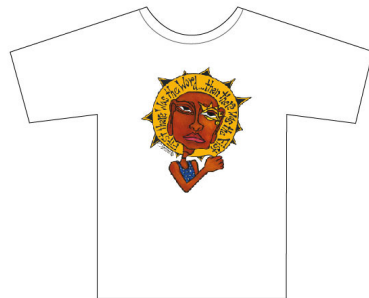
FRONT white fabric with 4-color graphic

- White t-shirts with logo printed in color on front, and summit name and dates on back. (T-shirts will be sold throughout the Summit, but we are accepting advanced payments with a discount)